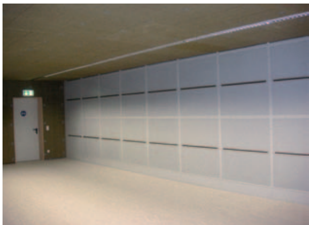
Air distribution wall with perforated air discharge panels and linear slot diffusers