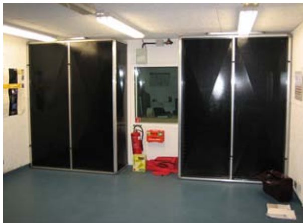
Former design of the wall (other manufacturer)