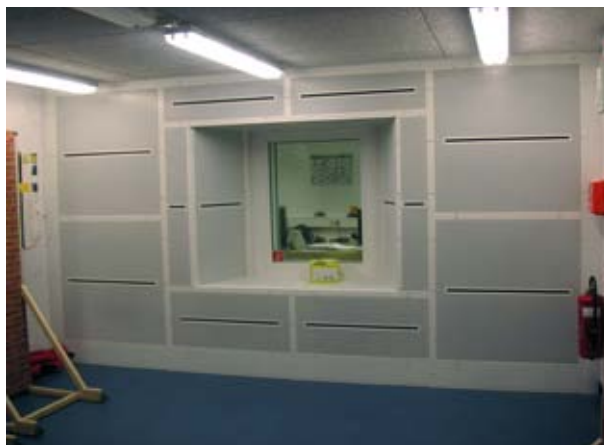
New design of the wall Make Krantz Components with improved indoor air velocity and flow direction