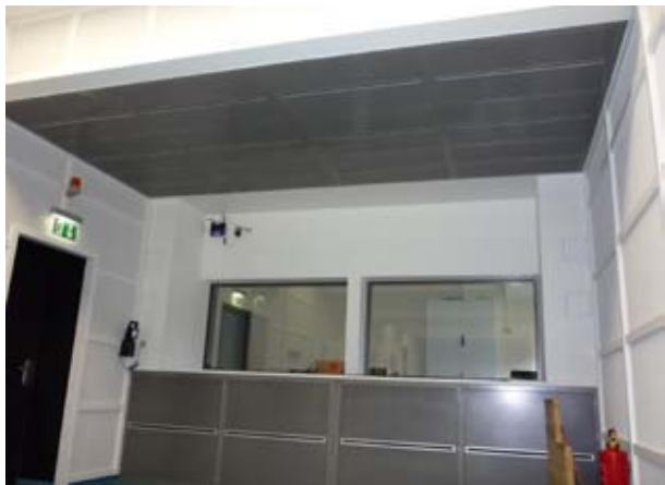
Indoor firing range with air distribution through ceiling and wall